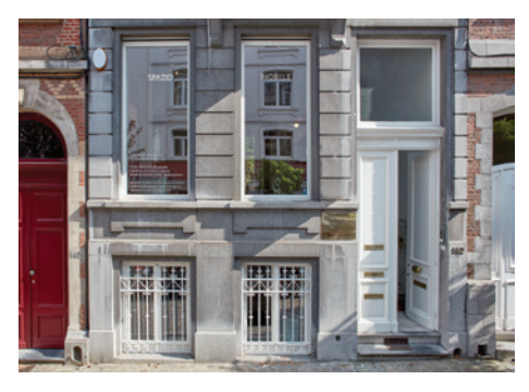
Rue Franz Merjay 142, 1050 Brussels, Belgium, www.spazionobile.com